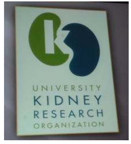
University Kidney Disease Research Associates unveiled its new name of University Kidney Research Organization (UKRO)