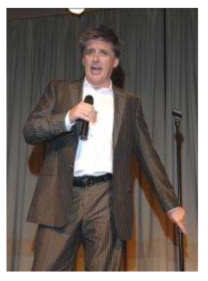
Craig Ferguson , star of The Late Late Show on CBS, entertained the audience with a stand-up comedy routine